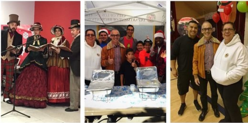
Yucca Community Center, and Silver Lake Recreation Center